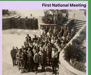
First National Meeting The first national meeting of the center directors is held.