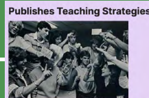
Publishes Teaching Strategies CEE publishes new teaching strategies for high school economics courses and teaching strategies for consumer economics.

and see CEE's major milestones and impact on America's teachers and students from 1949 to today.