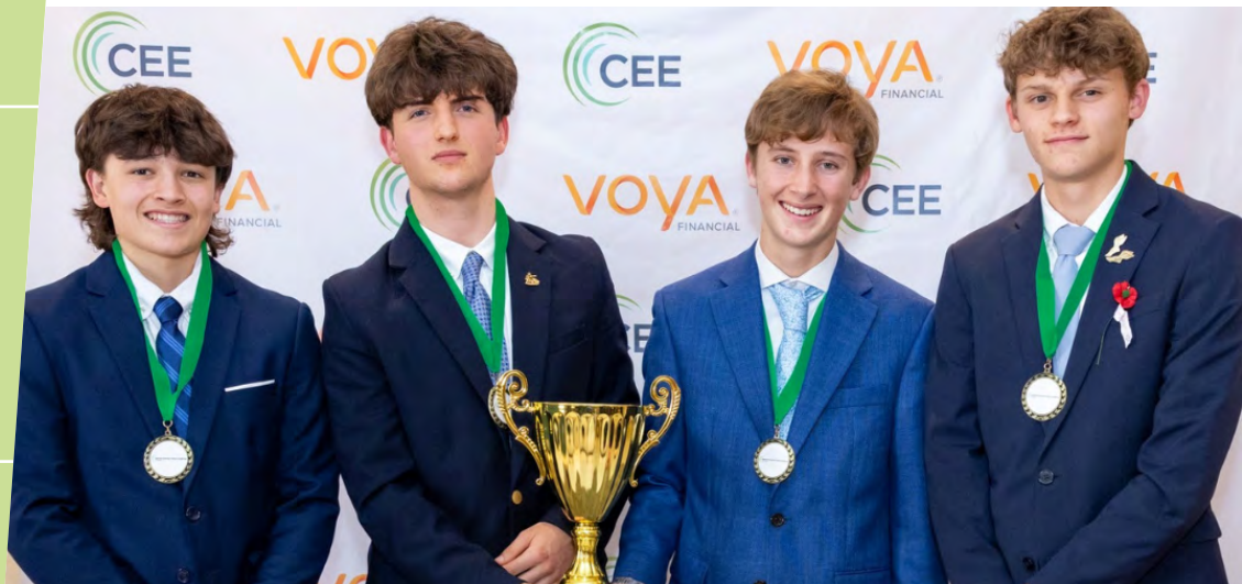
NPFC 2024 Winning Team from The Severn School, Severna Park Maryland.

Chairman of North Island and North Island Ventures, Co-Founder of Silver Lake 2024 Diamond Gala Honoree