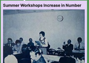
Summer Workshops Increase in Number CEE affiliates run 73 summer workshops.